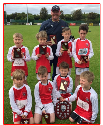
U8 Mervue Perpetual Shield Winning Team