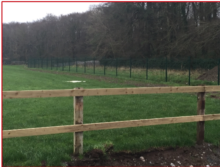
Metal Perimeter Fence, background. Pitchside Advertising Ready Fence, foreground

This fencing offers prime advertising space as all visitors to the grounds have to pass this route to access the car park area.