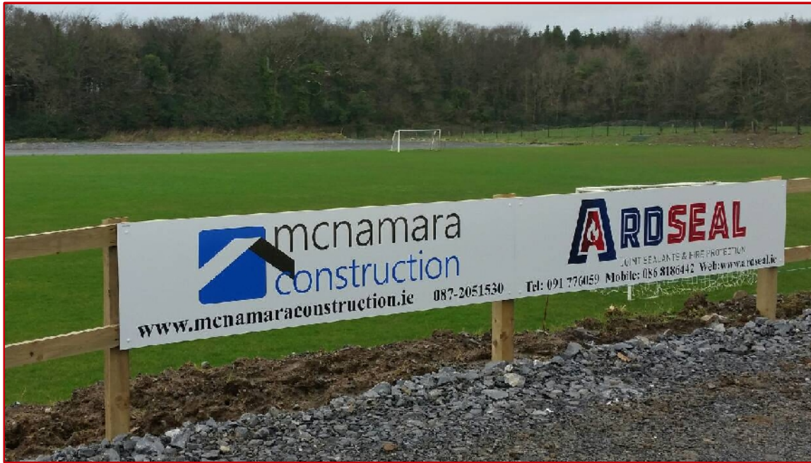
Signage facing front of new clubhouse facility overlooking Pitch & Car Park area