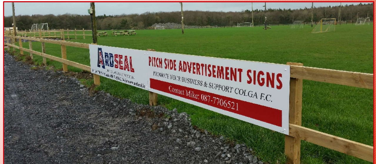
Wooden Advertising ready, traffic facing fence with clubhouse visible in top left hand corner of picture